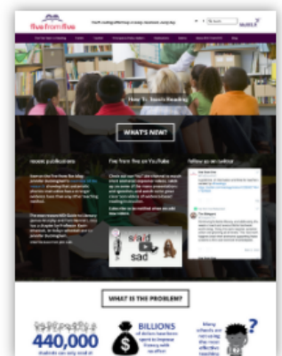
Five from Five information, research and resources