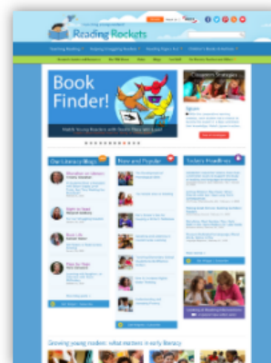
Reading Rockets research information and resources