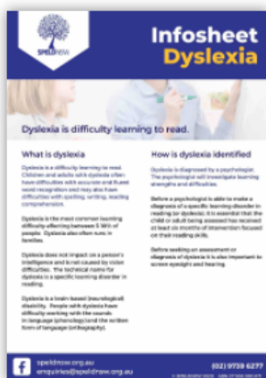
SPELD NSW Dyslexia InfoSheet

Visit SPELDNSW.org.au for information about reading instruction to support parents, teachers and other professionals, and schools. Parents can attend parent workshops/webinars to gain additional information and can contact the free SPELD NSW InfoLine for support, resources and information.