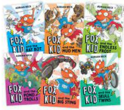
Fox Kid Series